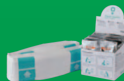
Film roll Polymer coagulant